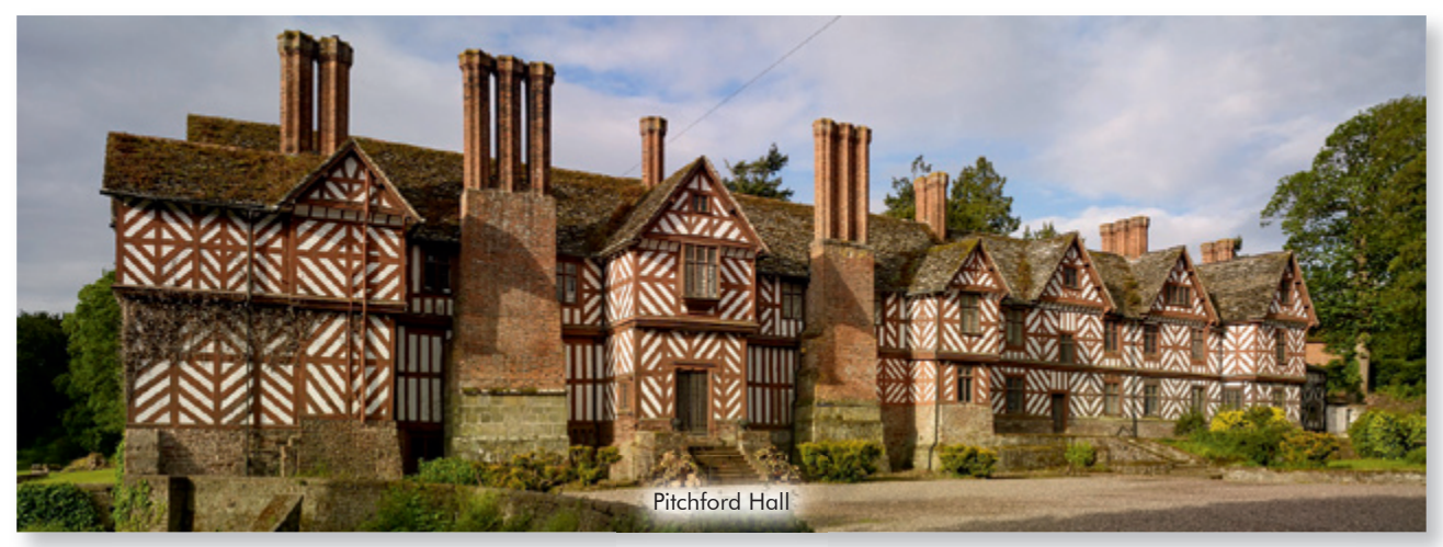
FAR HORIZONS: THE COUNTRY HOUSES AND GARDENS OF THE SHROPSHIRE MARCHES

Shropshire is one of the least-known and most unspoilt and beautiful counties of England. Deep in the countryside lie wonderful and important country houses of all periods, many with inspirational gardens, and almost all rarely open to the public. Some have belonged to the same family for over 500 years, giving a wonderful sense of history and continuity. Our week's tour will reveal in privileged private visits the hidden delights and architectural and artistic treasures of this very special county.